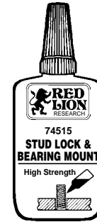
STUD LOCK AND BEARING MOUNT P/N 74515