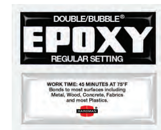
Double/Bubble® Regular Setting Epoxy • A low-viscosity adhesive • Fairly long work-life • Cures to a light color • Bonds well to wood, metal, concrete, fabrics and most plastics P/N 74493