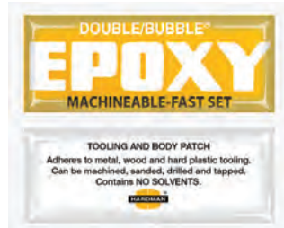
Double/Bubble® Machineable Epoxy • Machineable tooling and/or body-patching adhesive • Adheres to metal, wood and hard plastics • Can be machined, sanded, drilled and tapped P/N 74498