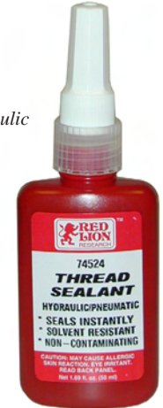
Thread Sealant P/N 74524