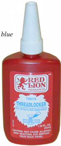
Threadlocker P/N 74513