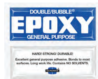
Double/Bubble® General Purpose Epoxy • A long work-life adhesive • For bonding wood, metal, ceramics, concrete, rubber & plastics P/N 74497