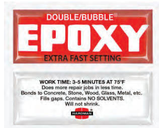
Double/Bubble® Epoxy Extra Fast Setting • Extra fast setting for quick repairs • For bonding wood, glass, metal, stone, concrete, ceramics & leather P/N 74499