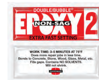
Double/Bubble® Extra Fast Set (Non-Sag) Epoxy • Extra fast setting • Non-sag (thixotropic) adhesive • For quick repairs • Bonds to wood, glass, metal, stone, ceramics and leather P/N 74492