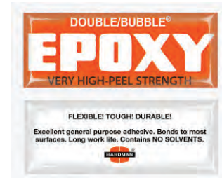
Double/Bubble® High Peel Strength Epoxy • A flexible, tough & durable, vibration resistant adhesive • High peel and shear strengths • Bonds to polystyrene, ABS nylon, metal, wood, masonry and rubber P/N 74496