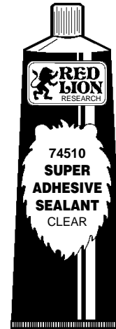
SUPER ADHESIVE SEALANT WITH APPLICATION NOZZLE P/N 74510