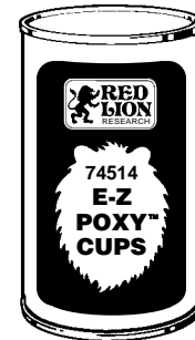
E-Z POXY CUPS P/N 74514