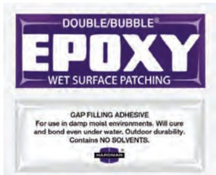
Double/Bubble® Wet Surface Patching Epoxy • A gap-filling adhesive for use in damp or moist environments • Cures and bonds under water • Bonds to stone, concrete, metal, glass, china, wood and fiberglass P/N 74495