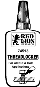
THREADLOCKER P/N 74513