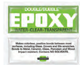
Double/Bubble® Water Clear Epoxy • Use as an adhesive or coating • Bonds to metal, ceramics, glass, porcelain and wood • Covers and fills scratches • Impact resistant P/N 74494