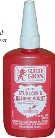
Stud Lock and Bearing Mount P/N 74515