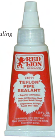
PTFE Pipe Sealant P/N 74511